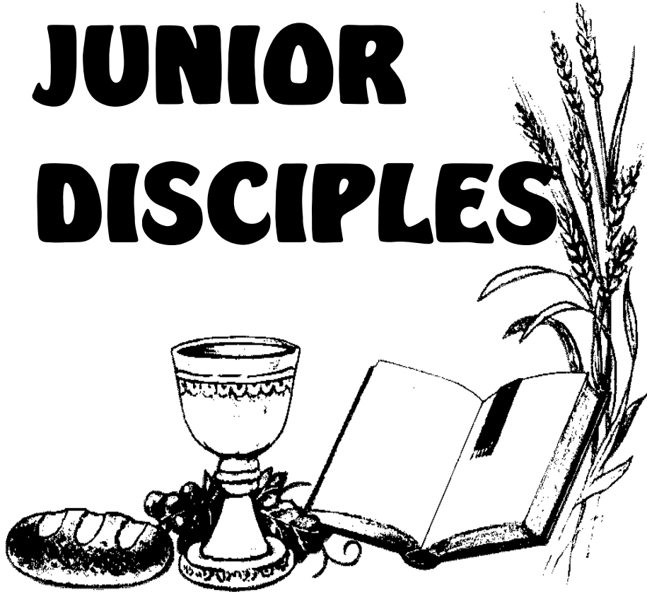
First Bible & First Communion